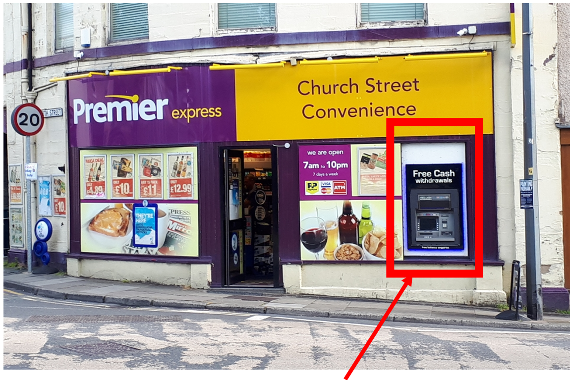
Development subject to this application